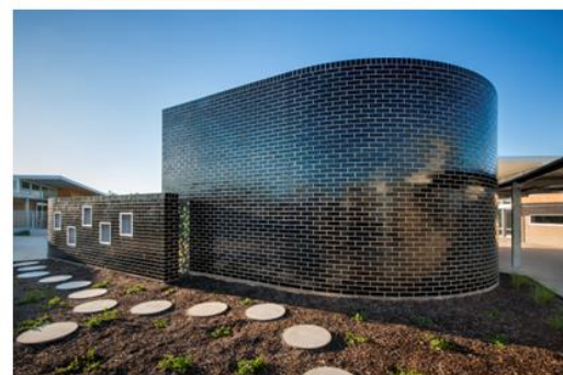
Elizabeth Special School