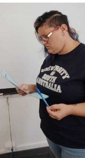
Developed by Learning Advisers & Study Help PALS 2022