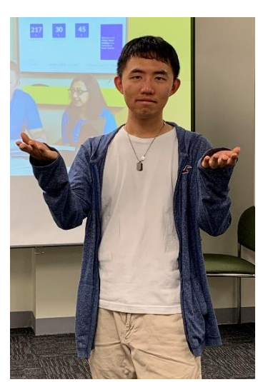
Developed by Learning Advisers & Study Help PALS 2022