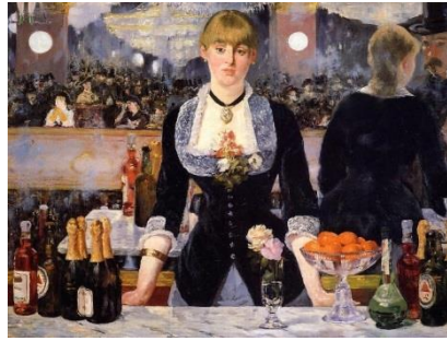
Edouard Manet's 1882 painting A Bar at the Folies-Bergère (Courtauld Gallery, London)