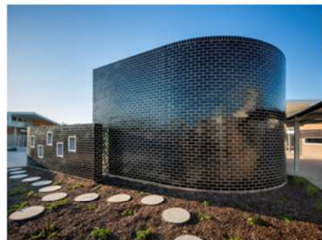
Elizabeth Special School