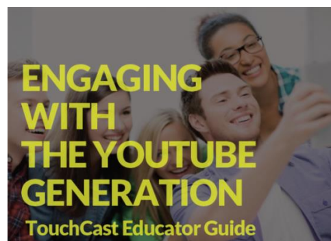
Figure 5 - TouchCast Educator Guide