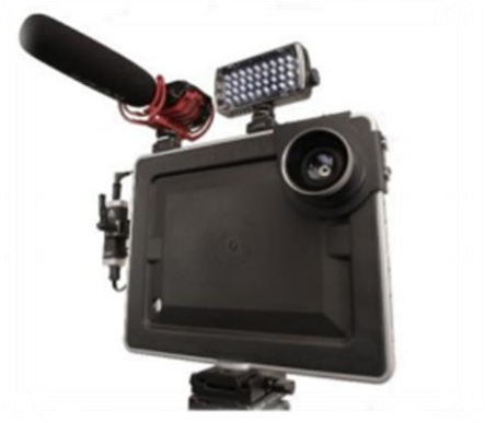
Figure 1 – UniSA Business School Mobile Video Kit

Either use the TouchCast app already installed on the iPad Air in the Business School mobile video kit or install the TouchCast app on your own iPad (v2 or newer), iPad Mini or Desktop PC ( Mac desktop version coming later in 2015 ) and you are ready to record professional-quality interactive videos with TC's built-in teleprompter, green screen, visual filters, sound effects, vApps and titles.