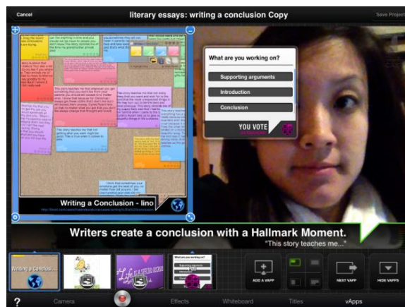
Figure 4 - Adding vApps to a video to make a TouchCast

TouchCasts can take the flipped classroom concept to a new level. Use them to include a wealth of related content and interactivity in concept videos that you may be considering as a replacement for your current lectures. TouchCasts will help convey your content in a more compelling manner by including vApps to deliver supplemental information from web pages, whiteboards, images, PDF's, news feeds, quizzes and polls etc in front of your video. Embedding or linking to TouchCasts from a learnonline course site makes them accessible to students anywhere, anytime. Lecture time can now be used for group discussion and other types of active, two-way learning including the opportunity for students to create TouchCasts themselves in/out of class.