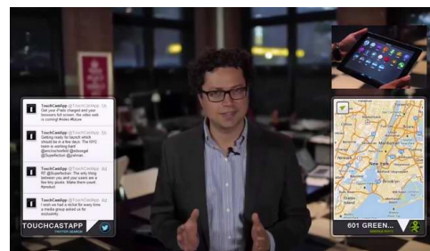
Figure 7 - Teach with your TouchCast